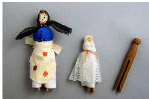
A Peg Doll