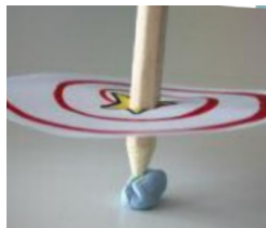
A Spinning Top